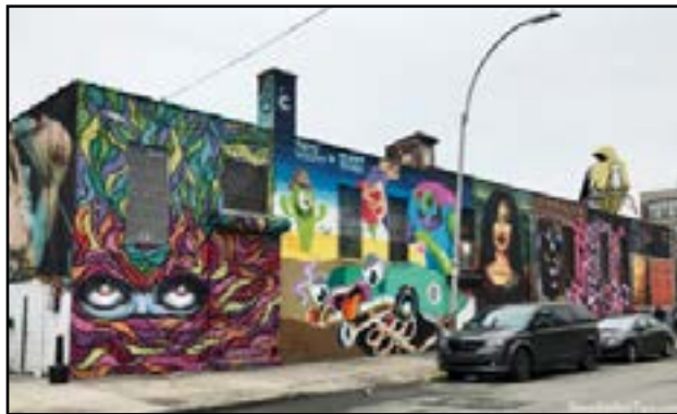
Example of street art adorning numerous blocks in Brooklyn's Bushwick community

It also limited large-scale development on side streets, although allowing for such structures on large boulevards such as Broadway. The plan also demanded the preservation of affordable housing and the creation of new historical districts, which have effectively limit-