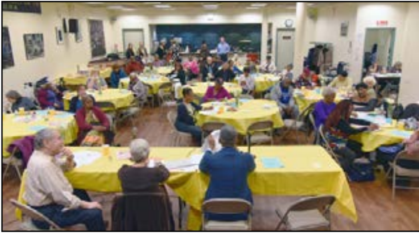
MLRC members at 2019 'Meet & Greet' event in April