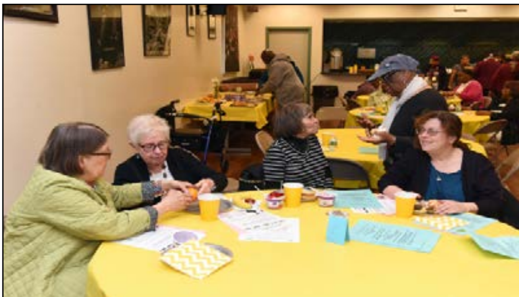
MLRC members discuss issues at annual confab