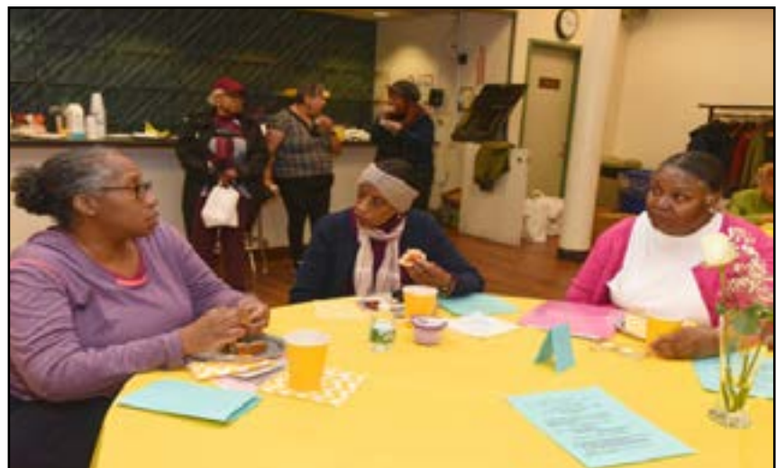
MLRC members discussing issues at annual 'Meet & Greet'