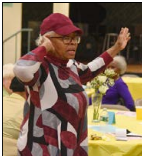
MLRC member at 'Meet & Greet' event