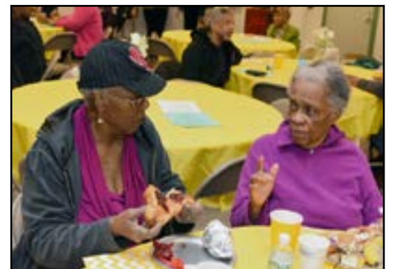
MLRC members at 'Meet & Greet' event